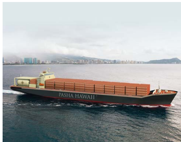
Rendering of the new Pasha Hawaii containership

MAN Energy Solutions enables its customers to achieve sustainable value creation in the transition towards a carbon neutral future. Addressing tomorrow's challenges within the marine, energy and industrial sectors, we improve efficiency and performance at a systemic level. Leading the way in advanced engineering for more than 250 years, we provide a unique portfolio of technologies. Headquartered in Germany, MAN Energy Solutions employs some 14,000 people at over 120 sites globally. Our after-sales brand, MAN PrimeServ, offers a vast network of service centres to our customers all over the world.